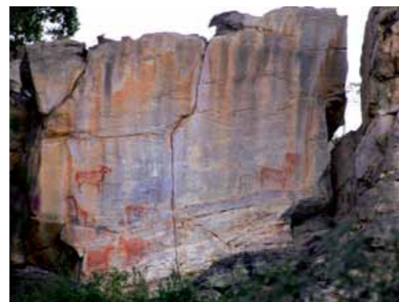
Left: Traversing a typical road at Nxai Pan. Top: The Earnshaw family poses for a picture. Above: The Van Der Post Panel of ancient drawings at Tsodillo Hills is very impressive.